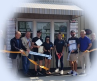
Mega Kone Ribbon Cutting