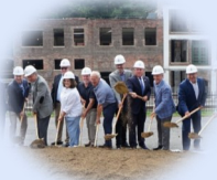
Barnett Mills Groundbreaking