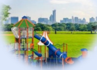
Park Equipment Updates